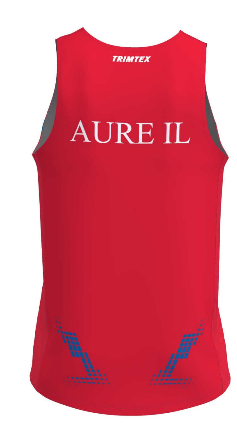
C18.2-L RUN SINGLET WOMEN