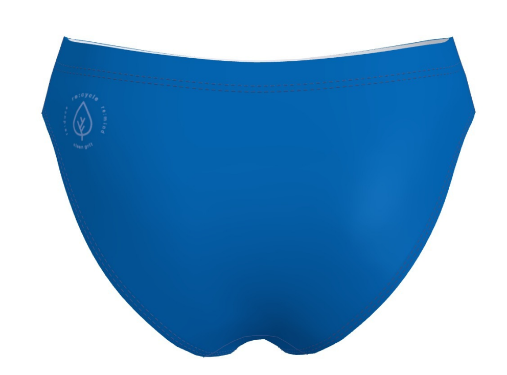
OOC!-C226-L LEAD SHORTS MEN thread: Sky blue 7342